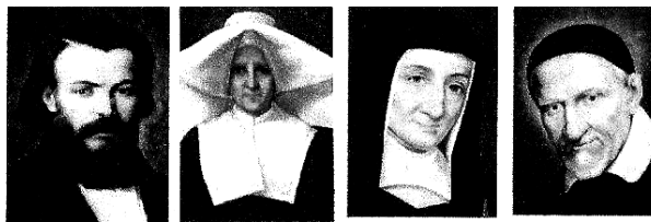
Blessed Frederic Ozanam

Jesus has returned to Heaven...victorious. Before He left, He challenged us to preach the Gospel, feed the poor, and clothe the naked, visit the lonely. Now you have a very powerful SOMEONE whom you know personally. Be confident that Jesus will answer your prayers “in His good time”.